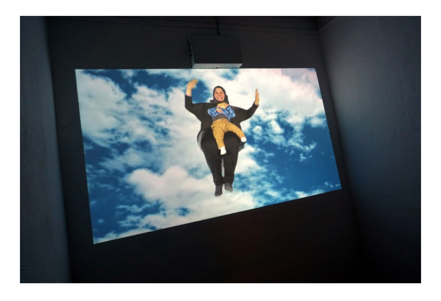
I am positive you are negative - "tvKUNST" on Danish national television channel DR-K, 2016

In my latest work I am positive you are negative I have been researching on politics of asylum in collaboration with asylum seekers and refugees in Copenhagen. Together we have created an essay film that captures the limbo in the asylum camps, a floating state in between what the asylum seekers call "positive" (residency permit) and "negative" (rejection of asylum case). In the film voices of people that seek or have been seeking asylum in Denmark reflect on the feeling of floating and flying, and poses ideas of a freedom of movement. The project was commissioned by Danish Art Council as a part of tvKUNST on DR-K.